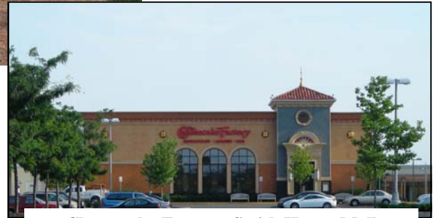
Cheesecake Factory, Smith Haven Mall

As a discipline, environmental, ecological and landscape design encompass the analysis, planning, design management and stewardship of the natural and built environments. We are pleased to offer our experience in: